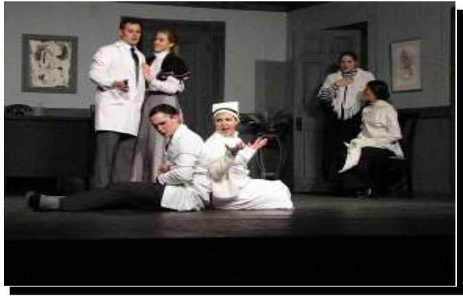
First Night Wrap Up