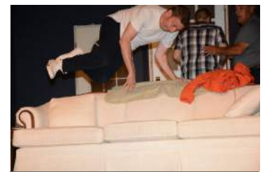
Action sequence from a show with lots of them.

Get tickets on-line at www.village-players.com with credit card or Paypal, or get them at Black's or at the door (while they last) with cash or check. On the day of performance you can only buy tickets at Black's or at the door.