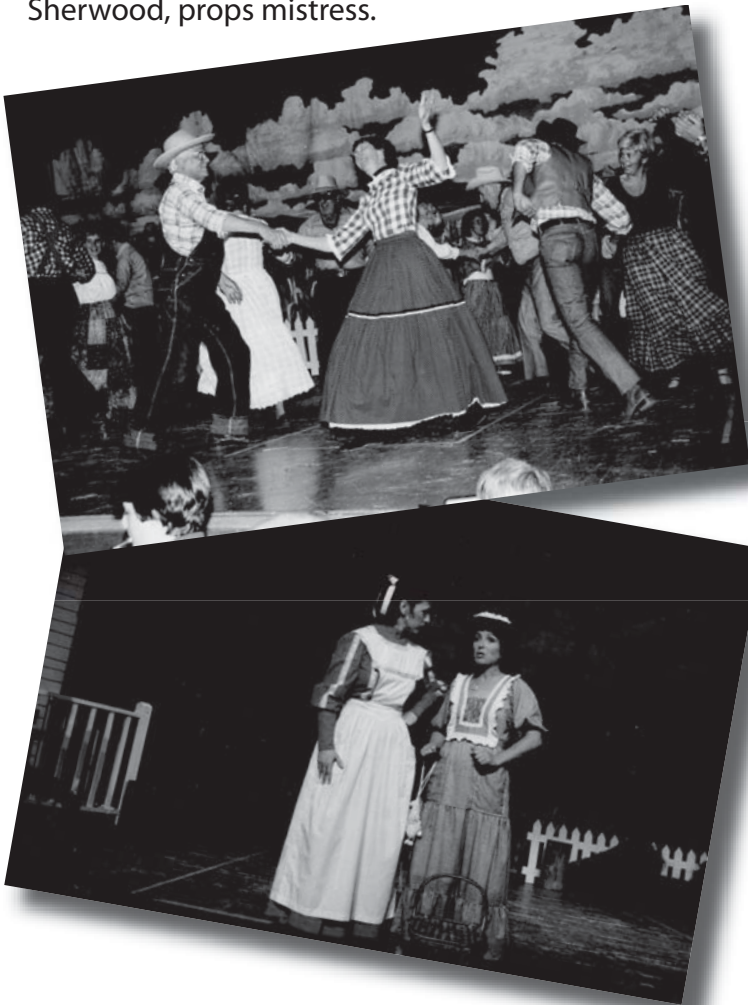
Photos from the original 1981 show