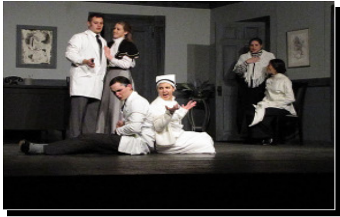
First Night Wrap Up